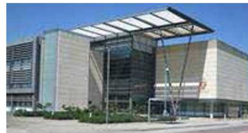
Council Building: Completed in 2004

Well maintained operational property includes two smaller “hub” offices in local villages