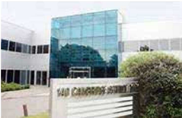
140 Cambridge Science Park

An expanding commercial property portfolio to support business needs