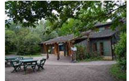
Milton Country Park Visitor Centre

Over 30ha of Woodland, parks and amenity land